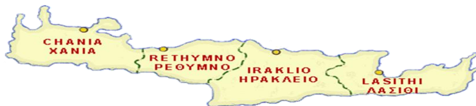
Figure 1. Cretan prefectures

Crete is generally considered to be a family resort, with 42% of total tourist arrivals representing families with children, 38% couples and 20% singles. It attracts predominantly 18-35 year olds (49%) while 36-45 years old accounts for 22% of arrivals. 46-60 years old represents 18% while 11% of tourists are 61 or older. The duration of the average length of stay on Crete has decreased from 2 weeks to 1 week and it has been fluctuating between 7.2 and 7.6 days. The tourist season lasts from March to November with July and August being the peak months. Visitors to Crete are thus predominantly summer visitors. ( http://userweb.port.ac.uk/~judgeq/IFEstudentwebpages/Stavroulakis/Statistics.htm )