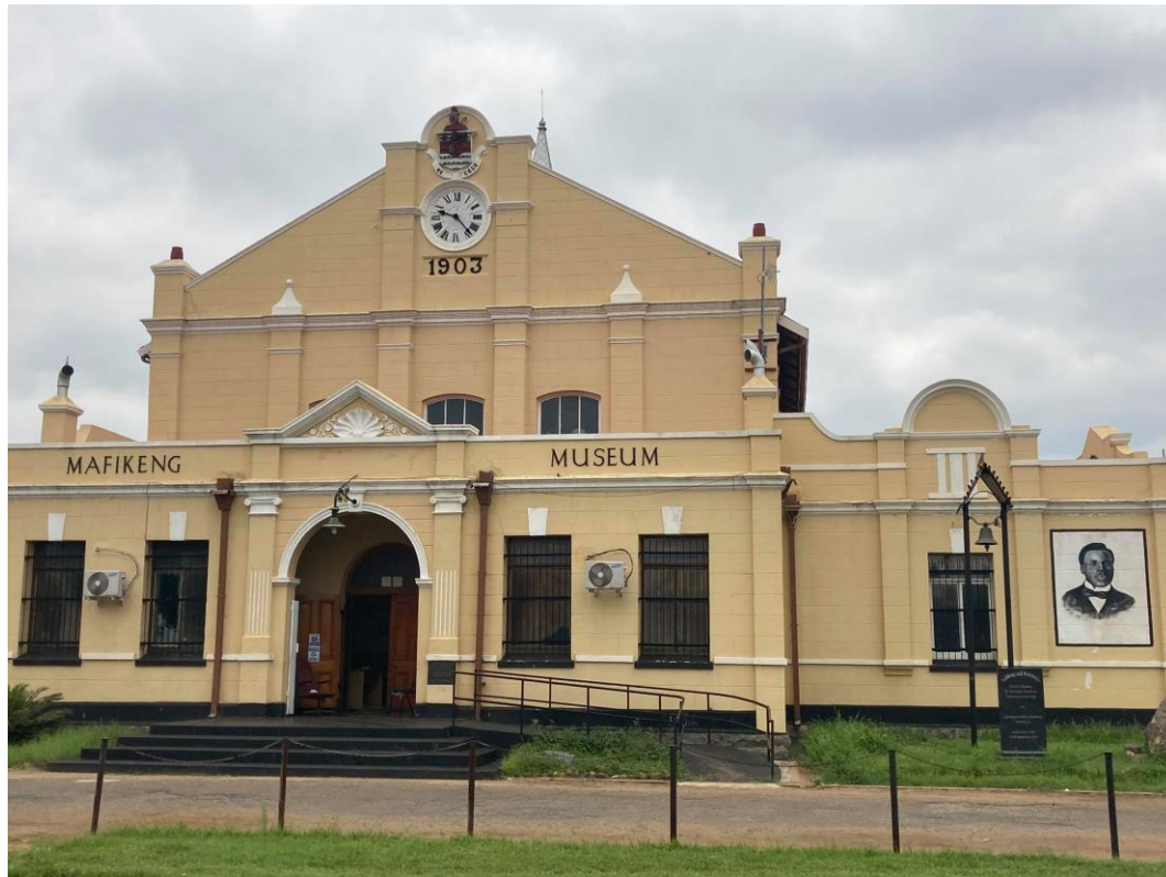
Figure 2: The Mahikeng Museum

An information video at the museum provides a shopping list of heritage sites to visit in the town relating to both colonial and Batswana heritage with a brief overview of what they are but minimal information on their significance. At some point there was an attempt to upgrade tourism infrastructure in the town with information boards being placed at heritage sites around the town. However, many of the boards have become faded or have been vandalised over time so that it is difficult or impossible to read. There are also no tourist guides who can take visitors to these sites and provide relevant information on them. With regards to the colonial heritage of the town, a number of Anglo-Boer War and Siege sites are listed within Ngaka Modiri Molema District including the Kraaipan monument where the first shot of the war was fired, Kanon Kopjie battlefield, grave sites and smaller places of interest like storage chambers. Due to the interest in battlefield tourism in South Africa, tourism to the Anglo-Boer War sites in the Ngaka Modiri Molema District and the Siege of Mafeking sites could be marketed under battlefields tourism and connected to other prominent battlefield sites like Magersfontein in the Northern Cape or Ncome, Talana, Rorkesdrift, Isandlwana and Bloodriver in KwaZulu-Natal (van der Merwe, 2014, 2019b).