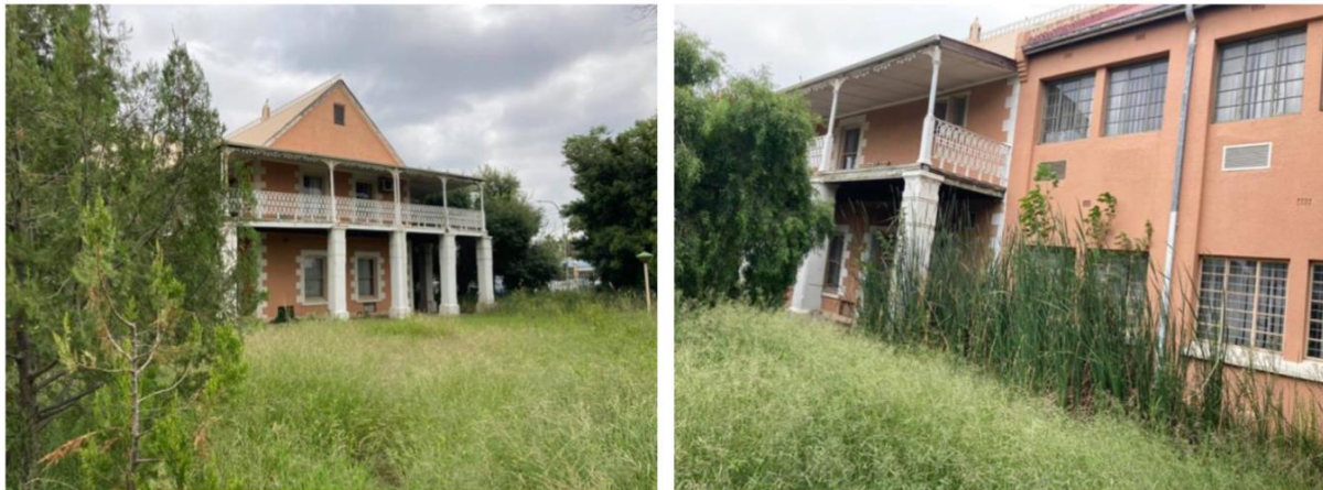
Figure 3: Exterior of St Joseph's Convent in Mahikeng