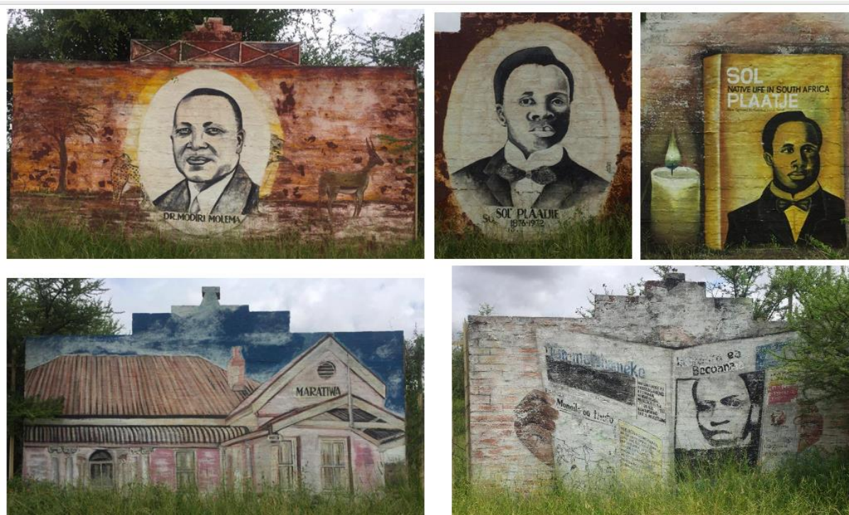
Figure 4: Selection of public art murals at Lotlamoeng Dam painted by L. G. Creative Artists 2008 From left to right: Portrait of Dr Modiri Molema; portrait of Sol Plaatje; one of Plaatje's books, Native Life in South Africa (1916); Maratiwe; copy of Koranta ea Becoana

A revival of the Lotlamoeng Cultural Village as an African cultural heritage attraction has been attempted but has been subject to discussion and negotiation between stakeholders for some time. The revival initiatives seemed to peak in 2018 when the North West government invited Credo Mutwa to return to Lotlamoeng. It was hoped that his presence would spark a renewed interest in the village and act as a catalyst for its development. The aim of this revival according to Ontlametse Mochware, the MEC for culture and traditional affairs, is to increase tourism activities, create jobs, “preserve our culture” and promote local economic development (SABC News, 2018, 3:18). Media images from Mutwa's 2018 visit to Lotlamoeng showed that the cultural village had been cleaned up for the occasion (SABC News, 2018). However, this impetus has unfortunately not been maintained as the site is now derelict and is overgrown with vegetation which makes it relatively inaccessible. The space is now being used as a grazing site for cattle, the artwork is not being cared for and some of it has been vandalised. Local government reports, however, that “a truly African cultural experience can be enjoyed. This can be built on by expanding cultural activities and having tourists partaking in events. The centre has been refurbished” (Mahikeng Local Municipality, 2020: 86). This is clearly not the case.