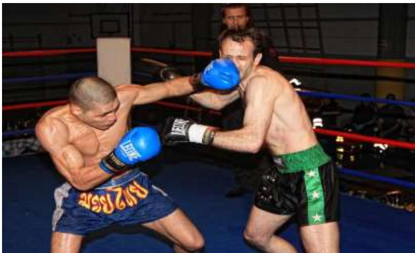
Image 1. Muat Thai Boxing: Available online at : https://cdn.pixabay.com/photo/2017/05/03/19/55/boxing-2282001_960_720.jpg

The result of the reliability check in the total system of the structural equation. The results were determined by statistically significant figures, including \chi^2/df values, = 1.962, P-value= 0.00, GFI= 4.18, AGFI=0.99 , IFI=1.91 ,TLI=1.42 , CFI=1.07 ; RMR=1.38 ; MSEA=0.029, respectively. Therefore, the updated model is presumed to adhere to empirical data. Table 1 can be used to describe the relationships between variables.