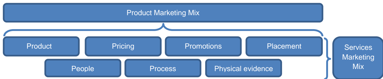
Figure 1. Service Marketing Mix (Hitesh Bhasin, 2019)

Nonetheless, due to the nature of the tourism business of Tongchom market which has a unique product offering list of local products and food, the researcher, used the 4Ps plus 3 marketing factors, i.e. people, physical evidence, and process (Chaiyuth, 2017) also known as the ‘Service Marketing Mix or 7Ps’. As shown in Figure 1 there are marketing control variables entrepreneurs use to respond to the target customer satisfaction (Kotler, 2003).