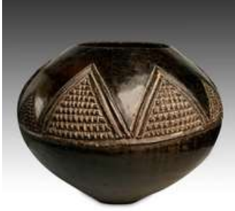
Figure 1. Examples of Zulu pottery wares

Prior to the 20<sup>th</sup> century, Zulu pottery wares were often acknowledged as historical and anthropological objects. However, in the early 1980s, the indigenous crafts were featured in art venues, and some of the first Zulu potters were acknowledged (Perrill, 2012). This recognition ushered in an increasing demand for the artworks, even up till today. The Zulu pottery wares can be found in various places; from the roadside markets and tourist destinations to national and international galleries and museums.