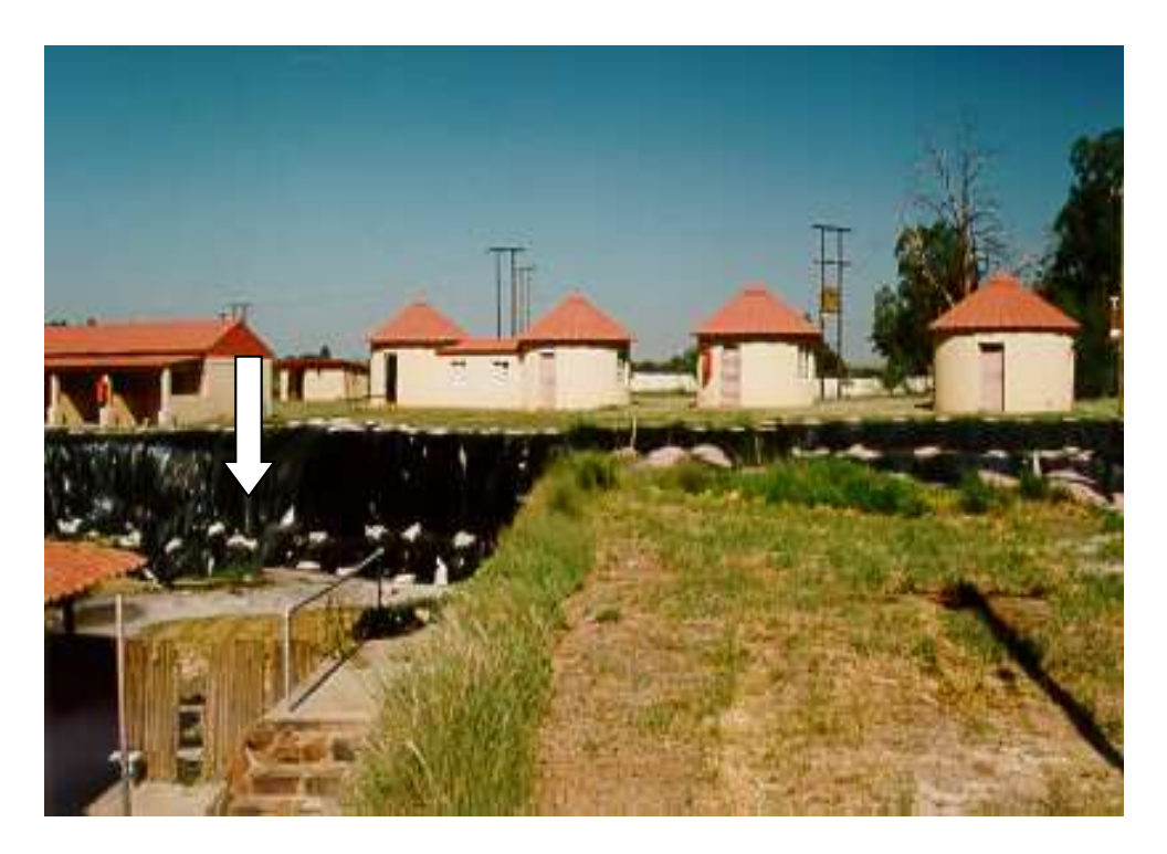
Figure 2. The Florisbad research station. Arrow indicates the main pit, where most of the excavations were undertaken (Rabumbulu, 2011).

The materials were later described as proof of the unequivocal association of extinct mammals with humans (Broom, 1913). "The excavations have also located and uncovered a rich Middle Stone Age horizon, dating to around 121 000 \pm 6000 years ago." (Brink, 1987: 163). Sporadic excavations where subsequently conducted for two decades, until the discovery of part of a human cranium, on the 25<sup>th</sup> of July 1932, in the spring eye by Professor T.F. Dreyer. In 1952 another series of excavations were started (Figure 2). Material from those excavations underlines the importance of Florisbad, since the material that was found was described as part of the Florisian Land Mammal Age established at greater than 130, 000 to about 10, 000 B.P. (Klein, 1984).