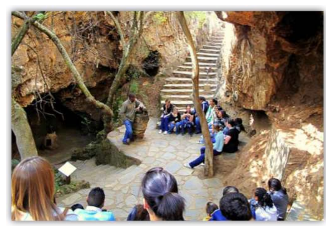
Image 2. Secondary guided school tour at the Sterkfontein Caves

Maropeng and the Sterkfontein Caves have United Nations Educational, Scientific and Cultural Organization (UNESCO) World Heritage Site status. Both these sites are operated by the Maropeng á Afrika (PTY) Ltd. The study was conducted with a sample of secondary teachers who participated in a guided school tour/s at Maropeng and/or the Sterkfontein Caves during the months of March and April 2016.