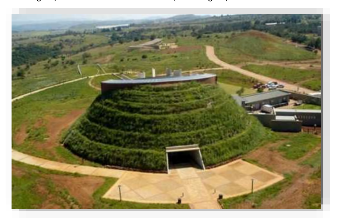
Image 1. Tumulus Building at Maropeng