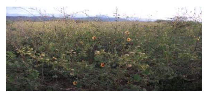
Fig. 7 Widespread invasive species in the Nech Sar grassland plains

While there is deforestation, overgrazing and over-utilization of resources undertaken on fragile ecosystems coupled with the current climate change, fertile grounds will be created for easily spreading invasive species which totally distress and dominate the existing natural ecosystem. Currently, there are many invasive species that are increasingly spreading around NSNP which have a negative impact on the sustainable use and conservations of the park. Conservation of the natural ecosystems is the primary means to control the expansion of invasive species and regulating the ecosystem dynamics.