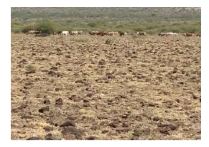
Fig.8 Habitat Destruction

The natural forest and wood lands are the habitats of important large and small animals. In NSNP, we find different animals: Zebra, Grant's Gazelle, Kudu and Lion. Despite the living space, the provision of food and water for these animals and birds, is the other extremely important aspet in a forest and woodland (Lemlem & Fasil, 2006). However their habitat is currently being destroyed by the over-grazing of cattle and rapid deforestation for different purposes (Desallegn, 2004; Freeman, 2006; NSNP report, 2010 cited in Samson, et al., 2010).