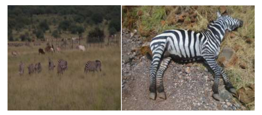
Fig. 9 Sharing of grazing land between the wild and domestic animals (left) and death of zebra by transmitted diseases (right)

revealed that wild animal migration as result of habitat destruction, is the greatest problem of the park. Many important fish, birds, and small and big mammals that live in the park ecosystem are being affected and their reproduction rate has also been critically disturbed.