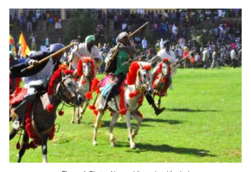
Figure 4 . Photo of horse riding cultural festival

There are distinctive cultural festivals that are practiced by people who live the vicinity of Alemsaga Priority State Forest. Cultural festivals like the wedding ceremonies, local music and dances, Feresgugis (Horse riding), Gena (Hokey) and tourism related festival including experiencing social holidays and festivals, and local performing cultures - are the most magnificent cultural attractions and these can also attract domestic and international tourists (Farta culture and tourism offices head). The figure below an example of a possible cultural ecotourism resources available around the Forest