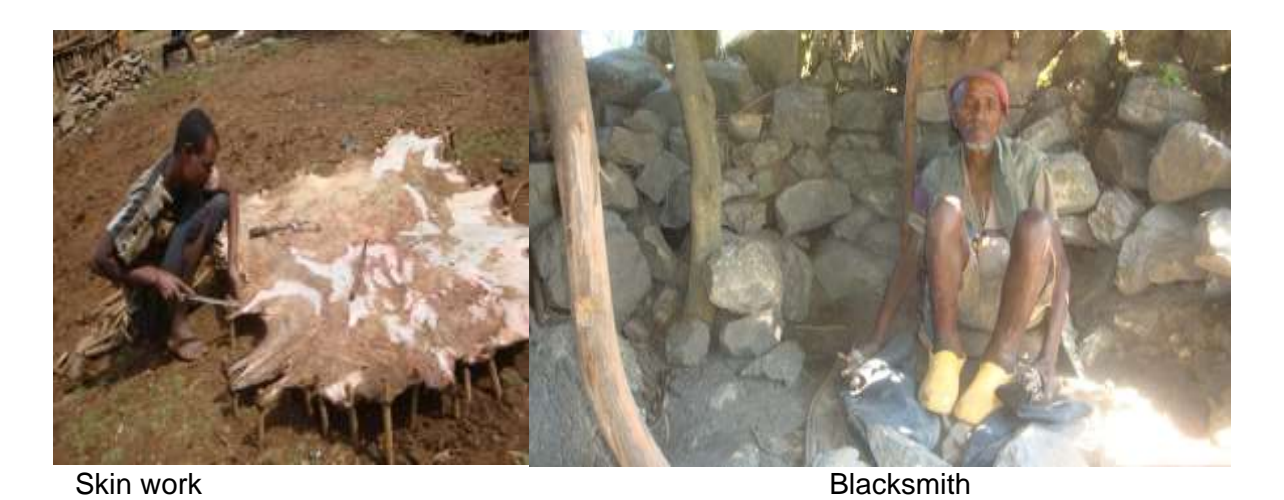
Figure 5. Photo of handcraft work the vicinity of the Forest

The study area and its vicinity are well known for handcraft products such as, artifacts made from animal horn, traditional garments and wool, jewelry, pottery, wooded objects, netting, weaving, basketry, traditional leather craft products, traditional music instruments, etc. Moreover, the people who live in vicinity of Alemsaga Priority State Forest are very skilled in the metalwork, and regional traditional blacksmithing in which metal is softened as it is put in a fire until it becomes red hot and worked on and then it is air cooled until it hardens and immerses in cold water and withdrawn from it.