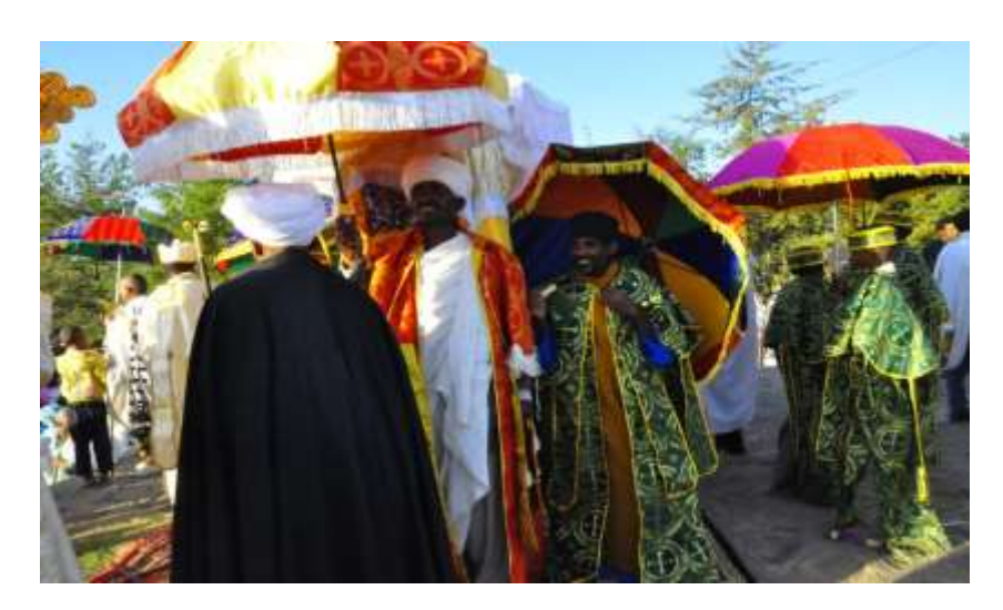
Figure 3. Photo of Timket celebration the vicinity of the Forest