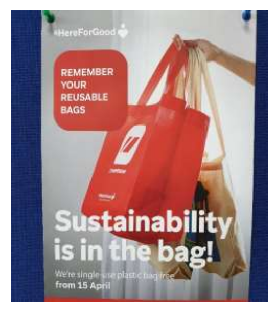
Figure 2. Sustainability promotion poster

The above triangle underscores the overwhelming impact of the institutional environment on the sustainability discourse of a nation. Suffice it to say that globalization has affected the control of national governments on the domestic environment (Held & McGrew, 2007), the relationship between sustainability and democracies can hardly be exaggerated. For example, a country like New Zealand with a strong institutional environment, which is evidenced in a near perfect democratic institution will have an unrestrained conversation about the sustainability of people, planet, and profits. supporting this narrative is the recent unanimous action by supermarkets in New Zealand to adopt and implement a no-plastic-bag policy and the outcome has been phenomenal. Arguably, this mover approach might not be unconnected with the level of awareness created by a strong institutional environment. Below is a poster by a retail chain in New Zealand to demonstrate their commitment to sustainability. some scientific commentators allude to the mitochondrial effect of institutional environments on the sustainability agenda. The mutual exclusivity of the two is yet to be established. Put simply, a strong institutional environment can be an enabler of sustainability and vice versa.