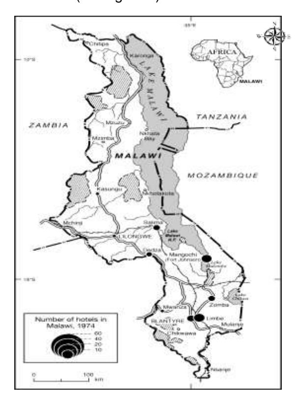
Figure 1. Map of Malawi showing the distribution of accommodation units in 1974

Furthermore, the development of this sector could have an indirect negative impact on the environment through the sourcing of construction materials. For instance, Chikoti (2017) reported that the Malawi government expressed concern with sand mining practices across the country because this exercise leads to environmental catastrophes such as floods which have in recent years affected the country. In the same line of thinking, Chikoko (2017), reported that cities and other development centers across the country are now experiencing flooding which could also be attributed to sand mining, resulting from the increased demand from the ever-growing hotel sector (see figure 2).